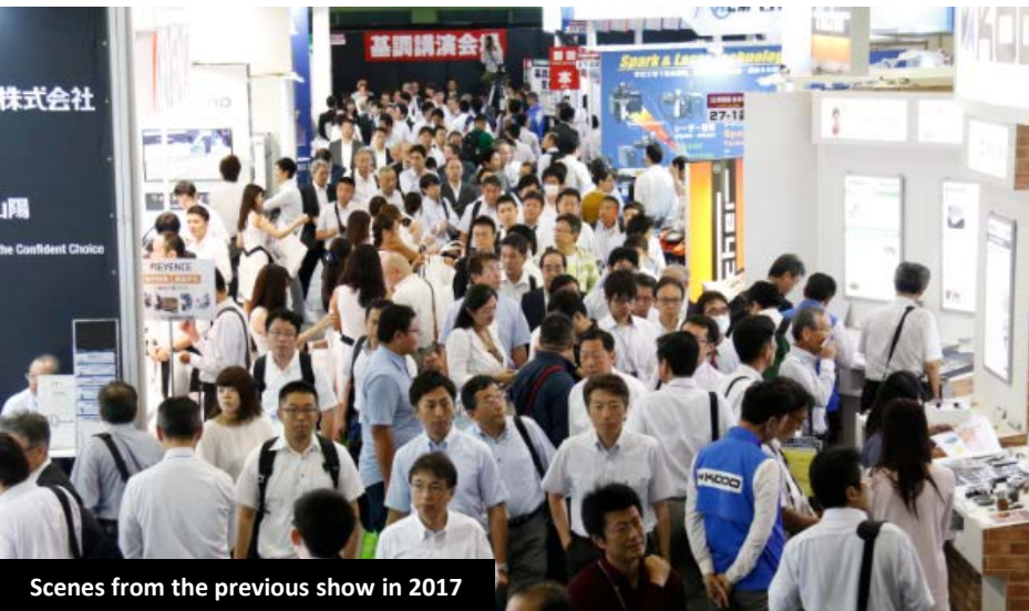
Scenes from the previous show in 2017